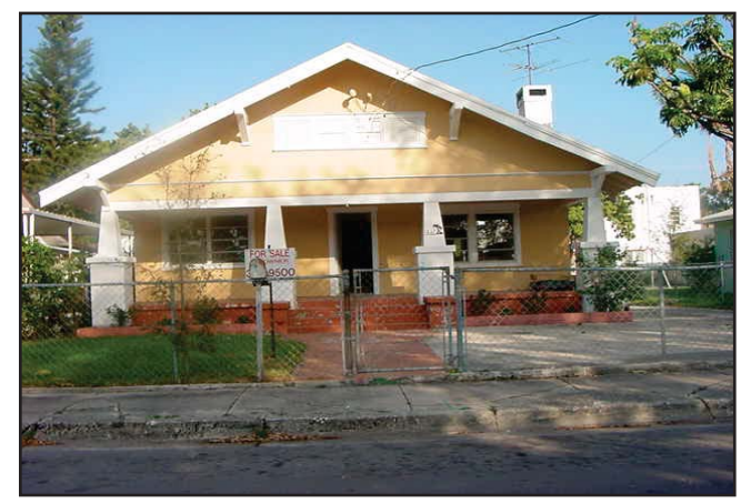
Wood frame house with roof bracket details in Highland Park

Park is a group of blocks forming a triangle; this area should be investigated for its potential to simultaneously 1) accommodate higher-density development taking advantage of the nearby Culmer Metrorail station and 2) compliment the adjacent historic neighborhoods of Spring Garden and Highland Park. Key factors in ensuring compatibility include location of parking, height and unit density of development, and treatment of project edges and entrances. In keeping with the open, eyes-on-the-street urbanism of Spring Garden and Highland Park, gates and high walls would be inappropriate, as would auto-oriented entry ways. All new development should respect the one- to two-story frame and masonry residential stock of these neighborhoods, with their rich and eclectic architectural character – including substantial concentrations of frame