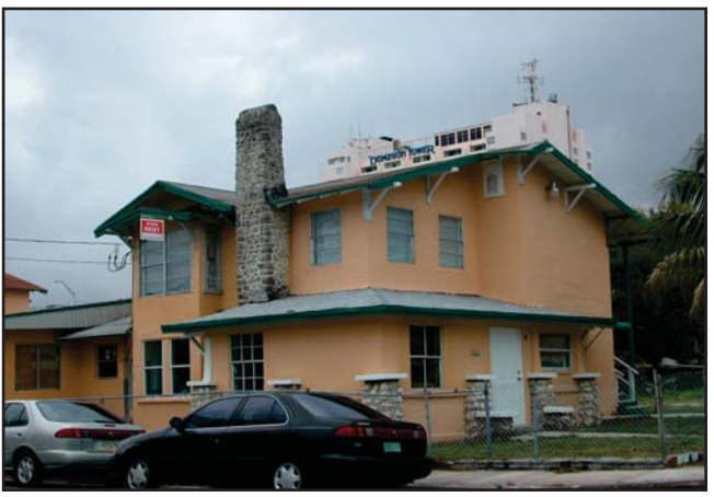
A potentially historic house in Highland Park that has been severely altered from its original layout

vernacular, bungalow, and Mediterranean revival structures – and mature tree canopies, including oak hammocks and a generous assortment of gumbo limbo, mahoganies, royal poincianas, coconut palms and royal palms.