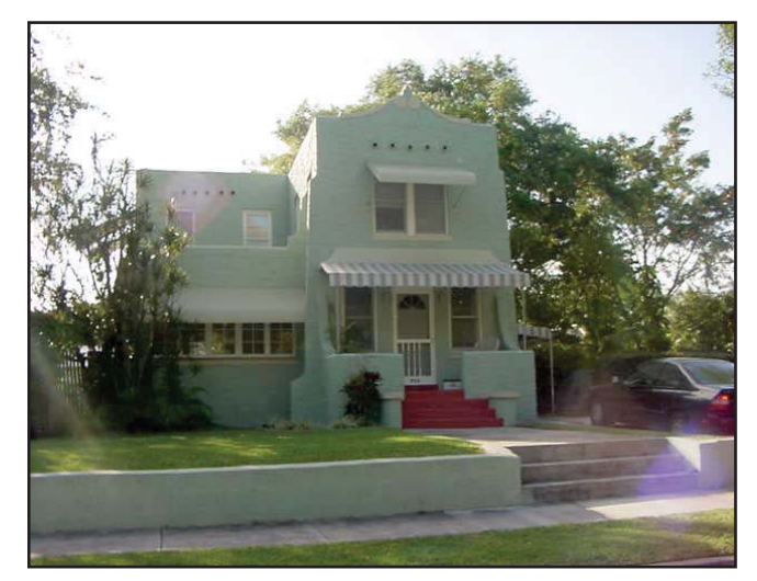
Two-story masonry house in Spring Garden walkways and passive green spaces to the extent possible.

North of NW 11<sup>th</sup> Street is Highland Park, a residential neighborhood distinguished by its significant concentration of frame vernacular single family homes dating from 1910s and 1920s. Few of its houses are elaborately ornamented, but its wood frame houses feature functional elements appropriate to the climate of the region, with porches, deep overhanging eaves, and layouts inviting cross-ventilation. The design of the neighborhood is of particular significance; Highland Park stretched long and narrow from NW 11<sup>th</sup> to 20<sup>th</sup> Streets, with blocks focusing on a series of centrally-located open spaces reminiscent of the neighborhood squares of Savannah, Georgia.