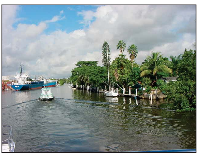
Spring Garden's tropical riverfront character

The neighborhood fell into decline as the decades wore on, and its original plan was interrupted with the construction in the late 1960s of an embanked highway severing the neighborhood at NW 14th Street. North of 14th the area was zoned Governmental/ Institutional to compliment the adjacent hospital-related uses, while the southern remnant was targeted for related high-density residential and office development. Construction of the Culmer Metrorail station at NW 11 Street reinforced this intent, but Highland Park failed to develop as anticipated. The area became one of speculative investment and deferred maintenance, with few homeowners and a transient renter population. Another result of the decline was the alteration of the characteristic features of many of its homes - porches enclosed, and floor plans subdivided by the creation of rental units. Preserved, however, were the neighborhood's mature oak, banyan, and mahogany trees, as well as one of its original community greens - a mahogany-shaded circle at the