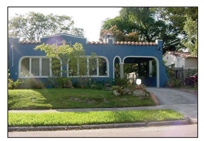
One story masonary house with mediterranean details

Running from southeast to northwest through the Spring Garden/Highland Park/Medical Center neighborhood is Wagner Creek, a partly culverted, partly exposed tributary of the Miami River. South of NW 11<sup>th</sup> Street, in Spring Garden, this water body is navigable and is known as the Seybold Canal. Not long ago declared to be the state's most polluted waterway, efforts to improve Wagner Creek have been moving forward slowly; efforts to dredge contaminated sediment from the creek are moving forward and the Miami River Greenway Master Plan recommends improving the banks of the creek with