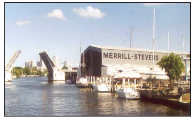
Merrill Stevens- Miami's oldest waterfront industrial business

North of the riverfront, there are several distinct