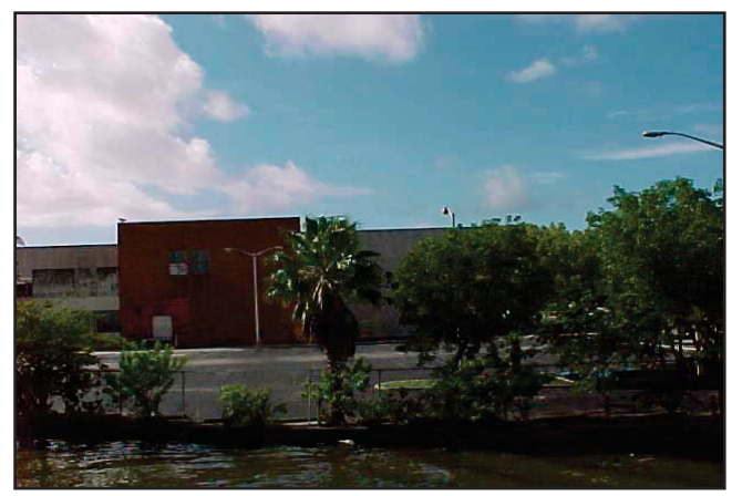
Redevelopment site- The former Miami News Site (20)

A redevelopment site of particular interest in this district is the former Miami News site, a large riverfront parcel to the east of NW 12<sup>th</sup> Avenue. The successful redevelopment of this site is viewed by many as a critical to the success of the surrounding area. While its size and waterfront location are appealing, the site has limited access; the possibility of improving access to the site from NW 12<sup>th</sup> Avenue southbound should be investigated so as to improve the site's linkage to the medical and civic centers flanking 12<sup>th</sup> Avenue just across the river.