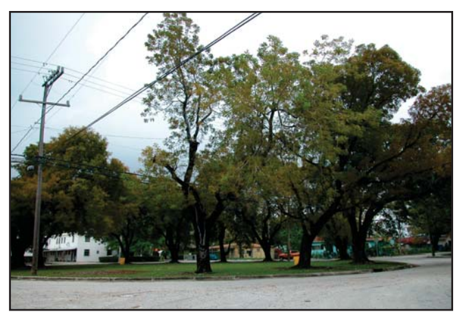
Mature tree canopy in roundabout at NW 13th Street and NW 8th Avenue

Between the Spring Garden Historic District and Highland