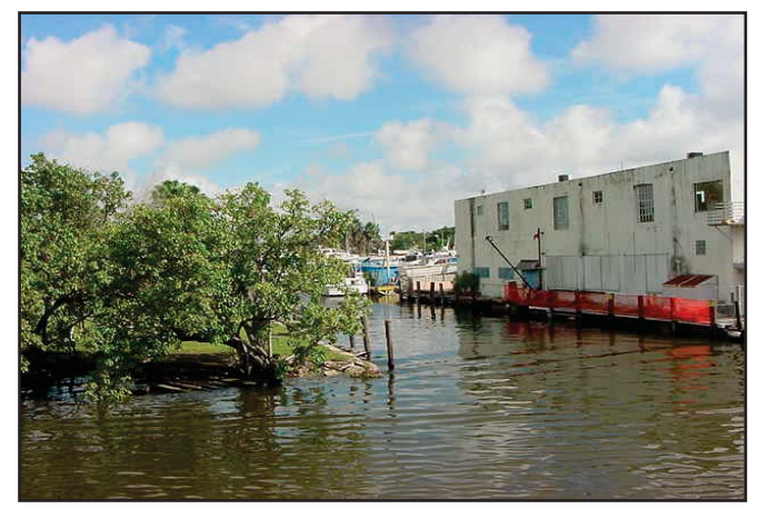
Looking north up the Seybold Canal. On the right is canal front property, that is well suited for water-dependant commercial or industrial uses.

As on the riverfront, liberal commercial uses should not be allowed on the Seybold Canal; water-dependent commercial or industrial uses, with associated mixed-use development, should be required where zoning presently allows for liberal commercial. Existing single-family zoning along the canal should be protected, while multifamily zoning should be treated as discussed in the previous paragraph so as to maintain