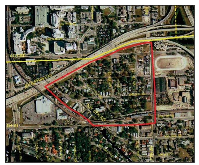
Highland Park Neighborhood Conservation District study area, outlined in red (22)

Park is a group of blocks forming a triangle; this area should be investigated for its potential to simultaneously 1) accommodate higher-density development taking advantage of the nearby Culmer Metrorail station and 2) compliment the adjacent historic neighborhoods of Spring Garden and Highland Park. Key factors in ensuring compatibility include location of parking, height and unit density of development, and treatment of project edges and entrances. In keeping with the open, eyes-on-the-street urbanism of Spring Garden and Highland Park, gates and high walls would be inappropriate, as would auto-oriented entry ways. All new development should respect the one- to two-story frame and masonry residential stock of these neighborhoods, with their rich and eclectic architectural character – including substantial concentrations of frame