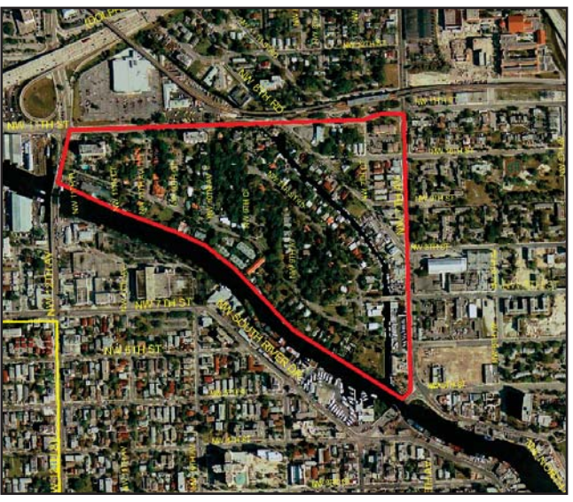
Spring Garden Neighborhood Conservation District study area, outlined in red (21)

the scale and character of the historic district.