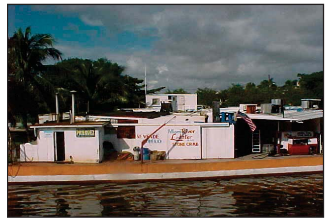
Miami River Seafood and Lobster in East Little Havana

physical and cultural enhancement to the neighborhood but will provide improved educational opportunity as well.